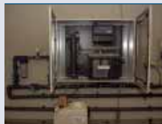
Example of use: CLS 500